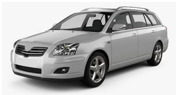
Toyota Avensis II Estate (2003-2009)

Instrucciones de instalación Istruzioni per l'installazione Upute za sastavljanje Instrucțiuni de montaj Návod na montáž